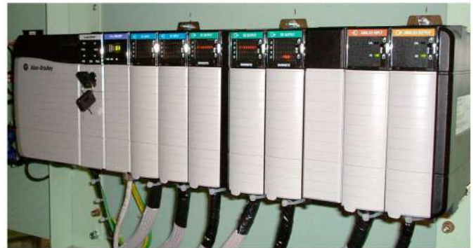
External View of PMS2003